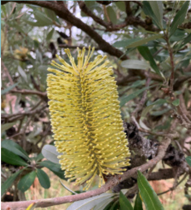
9 Coast Banksia Banksia integrifolia