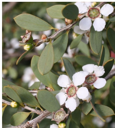
4 Coast Teatree Leptospermum laevigatum