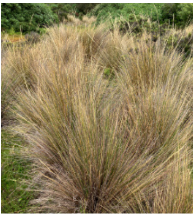
3 Coast Spear-grass Austrostipa stipoides