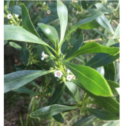
2 Common Boobialla Myoporum insulare