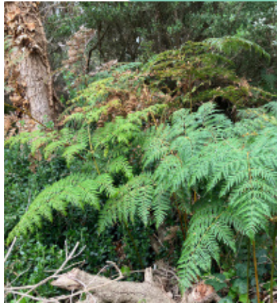
10 Bracken Fern Pteridium esculentum