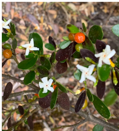
16 Sea-box Alyxia buxifolia