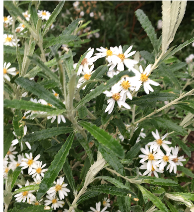
1 Dusty Daisy-bush Olearia phlogopappa

Funding for rehabilitation and planting has been provided by the Victorian Government through Coastcare Victoria, with volunteers leading and undertaking the works.