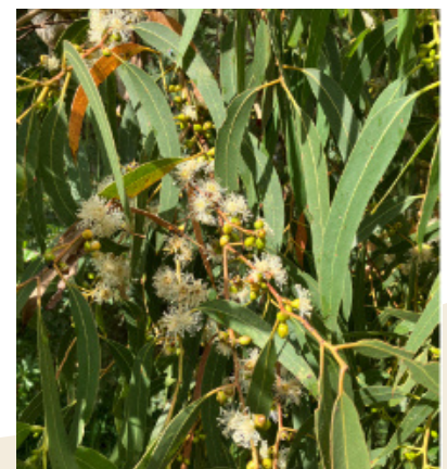
8 Manna Gum Eucalyptus viminalis ssp. pryoriana