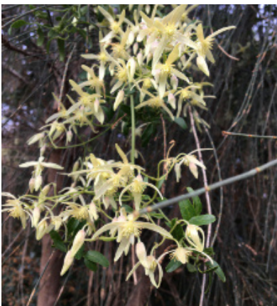
15 Small-leaved Clematis Clematis microphylla