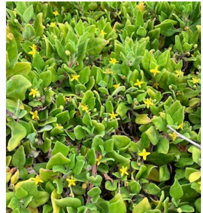
14 Bower Spinach Tetragonia implexicoma