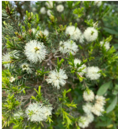
13 Swamp Paperbark Melaleuca ericifolia