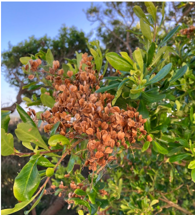
12 Sweet Bursaria Bursaria spinosa