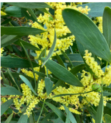
6 Coast Wattle Acacia longifolia