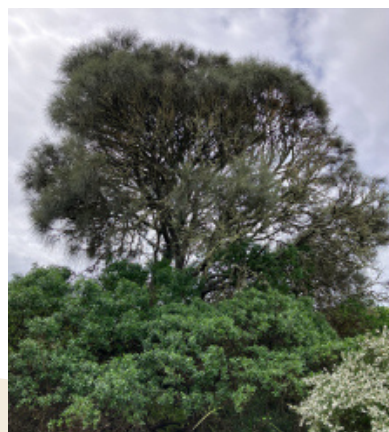
7 Coast Sheoak Allocasuarina verticillata