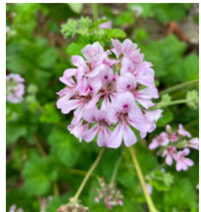
17 Austral Stork's-bill Pelargonium australe

The information for this Indigenous Plants sheet for CBWP has been collected by volunteers and may need to be updated as new information becomes available. Last updated: October, 2023