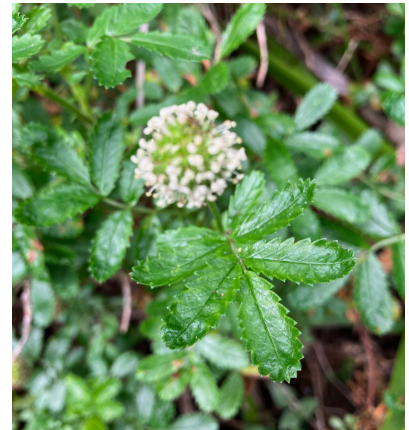
14 Bidgee-widgee Acaena novae-zelandiae