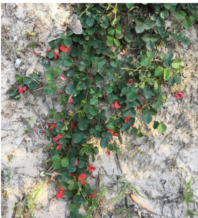
15 Running Postman Kennedia prostrata