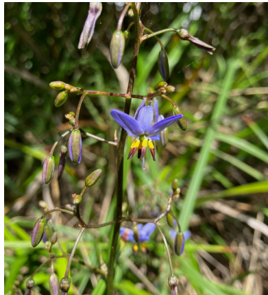
13 Coastal Flax-lily Dianella revoluta