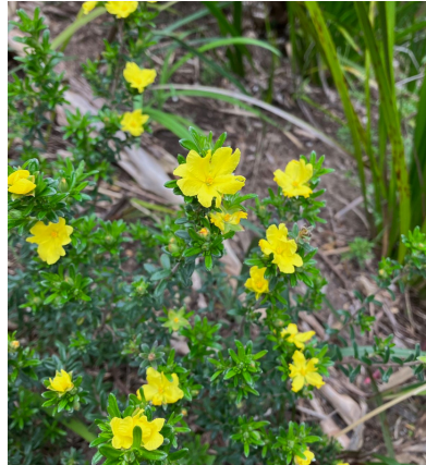
1 Silky Guinea-flower Hibbertia sericea

This indigenous plant information sheet identifies and illustrates some of the smaller plants which flower in Spring. The sheet was designed for an activity which started on the north side of the road at the second access gate near the 80 km sign. Good examples of the listed plants are found in order if starting at the gate and walking towards the inlet. This sheet can be used in conjunction with Indigenous Plants #1 which illustrates some of the larger trees and shrubs found in the reserve.