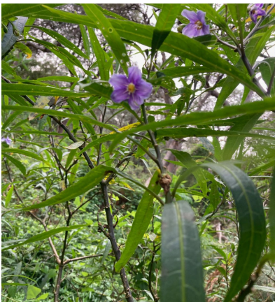
12 Kangaroo Apple Solanum aviculare