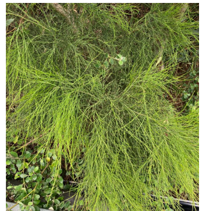
17 Coast Ballart Exocarpos syrticola

The information for this Indigenous Plants sheet for CBWP has been collected by volunteers and may need to be updated as new information becomes available. Last updated: November, 2023