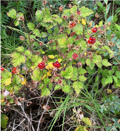
9 Native Raspberry Rubus parvifolius