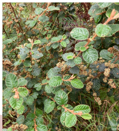
7 Bassian Dogwood Pomaderris oraria