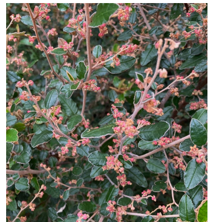
5 Coast Pomaderris Pomaderris paniculosa