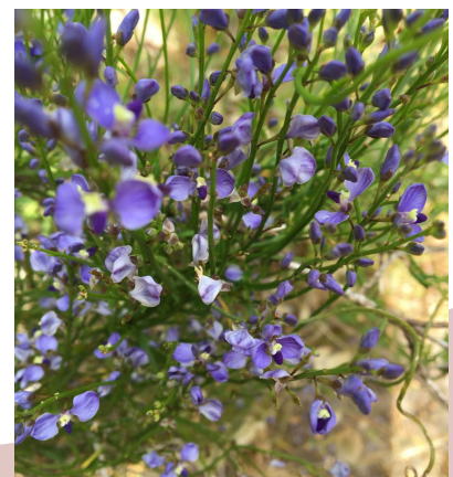
8 Love Creeper Comesperma volubile