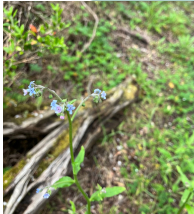
10 Australian Hound's Tongue Cynoglossum australe