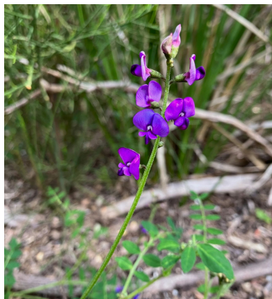
16 Coast Swainson-pea Swainsona lessertiifolia