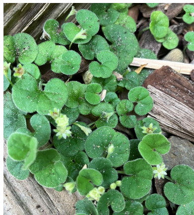
4 Kidney Weed Dichondra repens