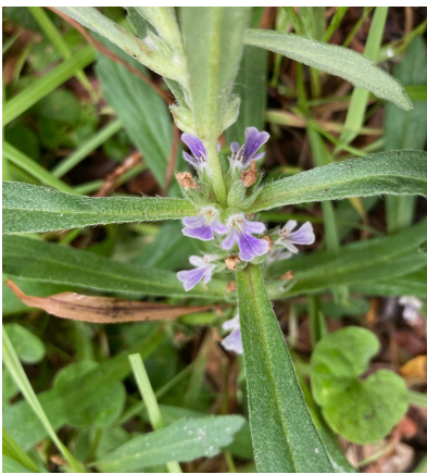
3 Austral Bugle Ajuga australis