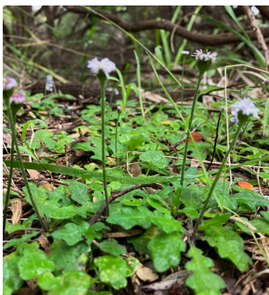
6 Blue Bottle-daisy Lagenophora stipitata