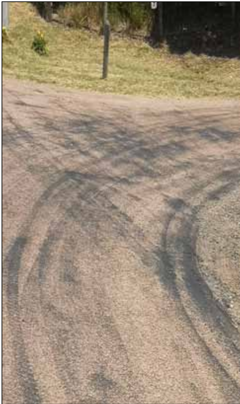
Above: Junction of Sunshine Rise and Park Ave Right: the parking area outside the General Store