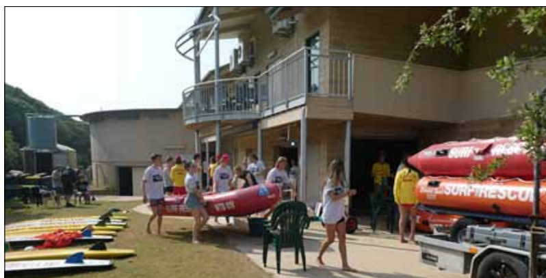
Above: WBSLSC preparing for the 2020 Current Cruiser event

Links to sponsors are available on the WIN Network Current Cruiser website.