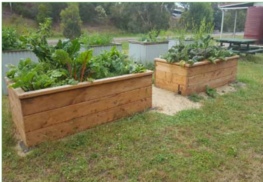
Our wicking beds will look very similar to these cypress pine clad wicking beds pictured recently at the Fish Creek Community Garden.

We're hoping to start work on this soon and will keep you posted via our newsletter on the development of the Garden.