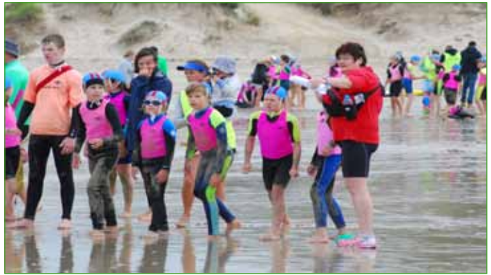
Photos taken in 2020 before COVID restrictions were in place. Please note that we will be operating in a COVID safe way this year as per Life Saving Victoria's directions.